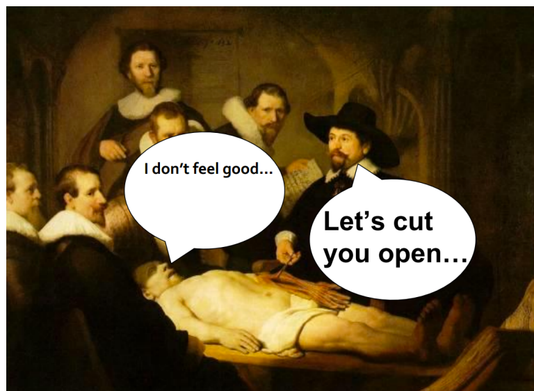
Figure 1: Rembrandt, "The Anatomy Lesson of Dr. Nicolaes Tulp," 1632 (with modifications). 1

If this were the 17th century, medical imaging would be something like this: